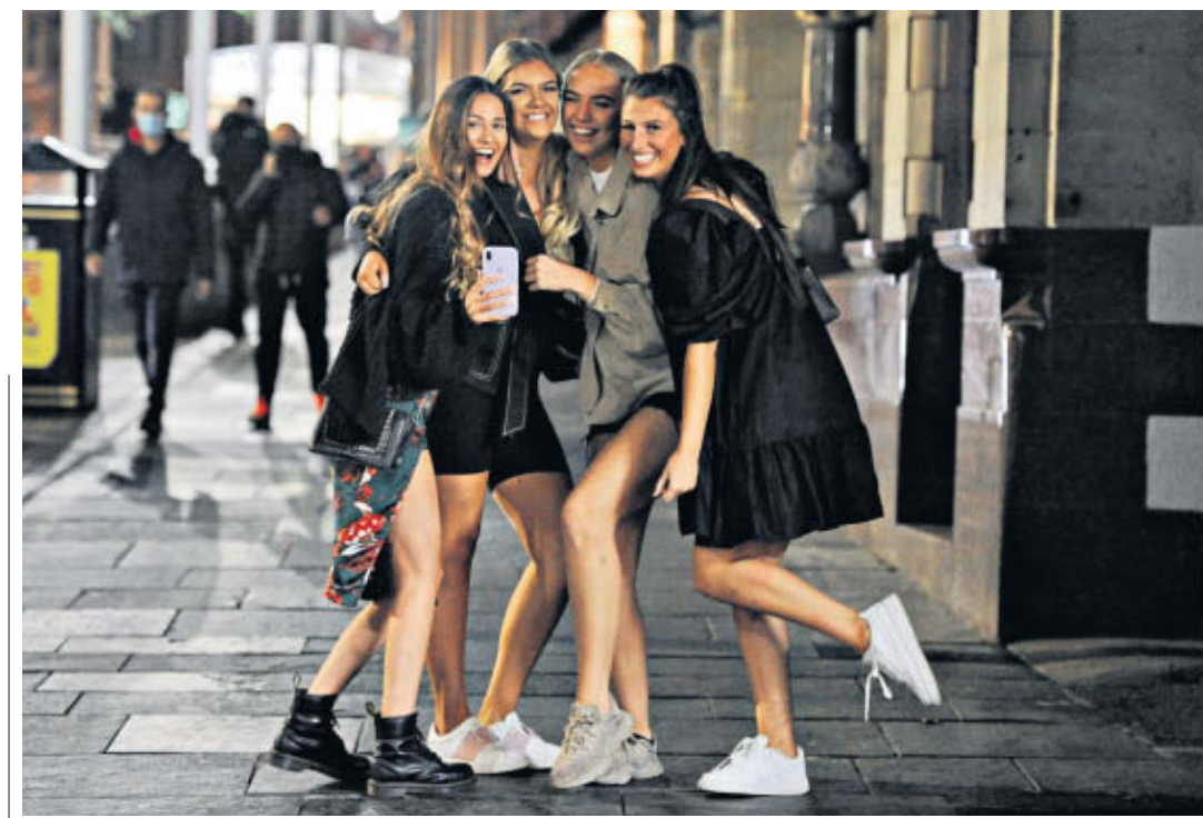
Revellers, above and right in Newcastle's Bigg Market, where pubs closed at 10pm due to the new Covid-19 restrictions

A couple of hundred yards down the hill a few freshers were smoking outside Bijoux, a bar on Mosley Street. They were some of the first to arrive of this year's Newcastle University intake, the majority of whom get here in residential halls. The new arrivals will find that security guards are patrolling the six-person flats to which freshers are assigned, breaking up gatherings and